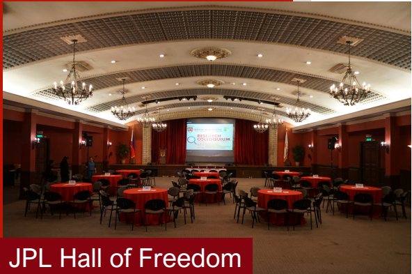
JPL Hall of Freedom