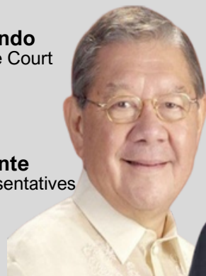
Hon. Sonny R. Belmonte Speaker of the House of Representatives 2001, 2010 - 2016