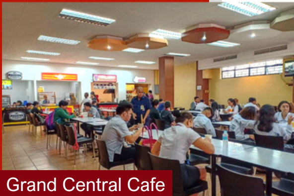
Grand Central Cafe