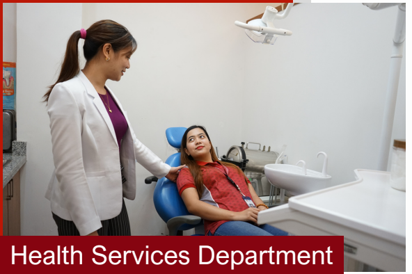
Health Services Department