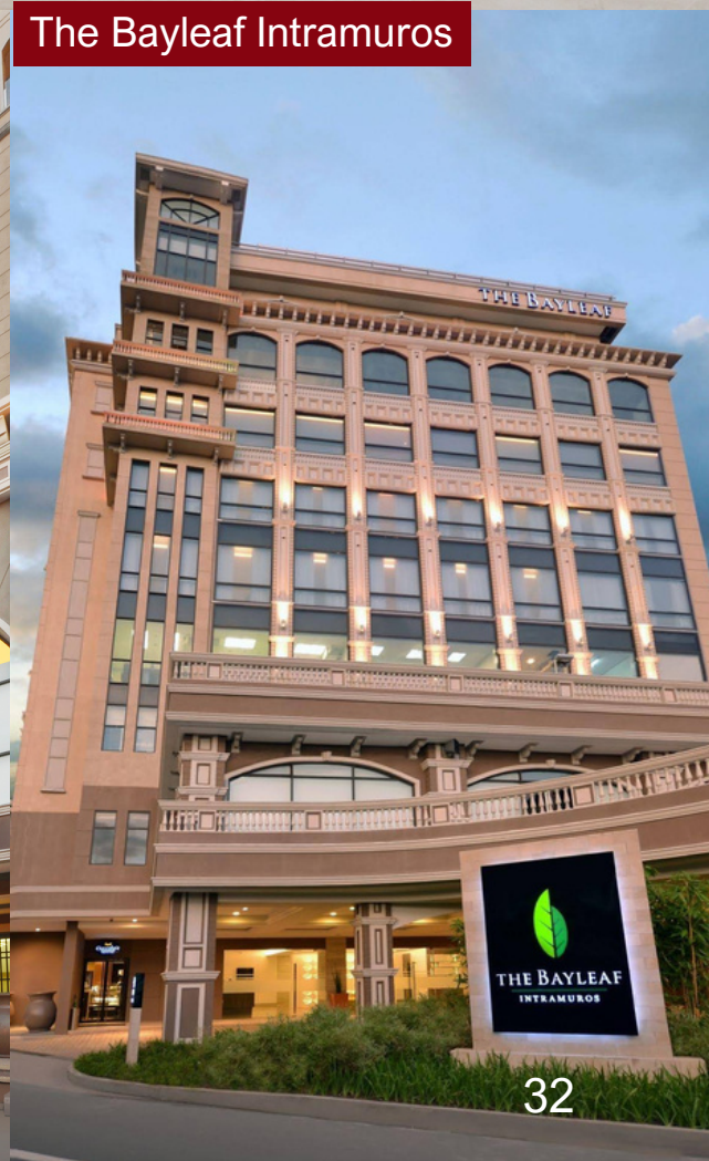
The Bayleaf Intramuros