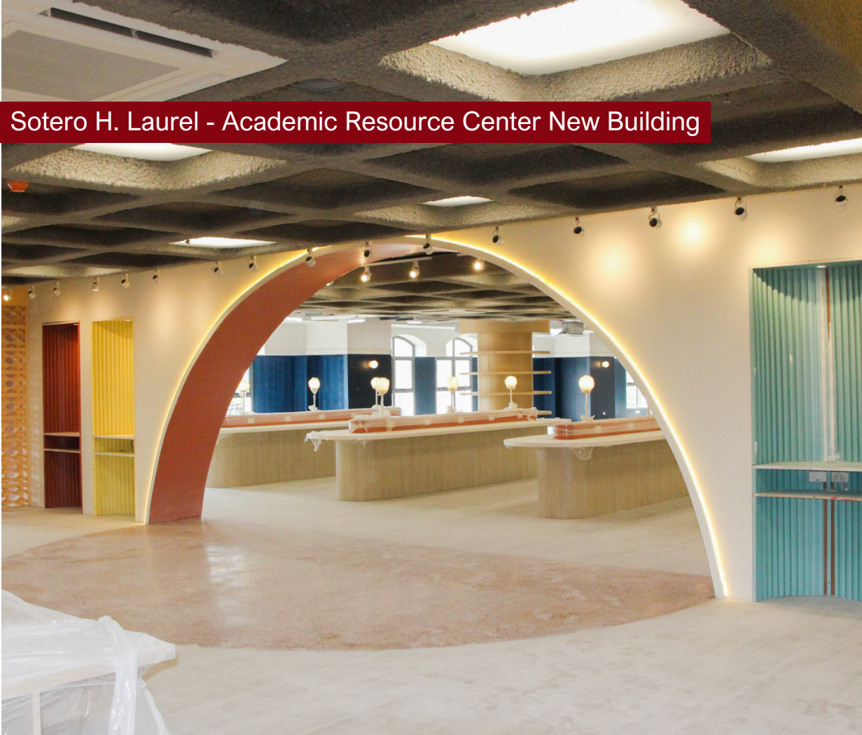
Sotero H. Laurel - Academic Resource Center New Building