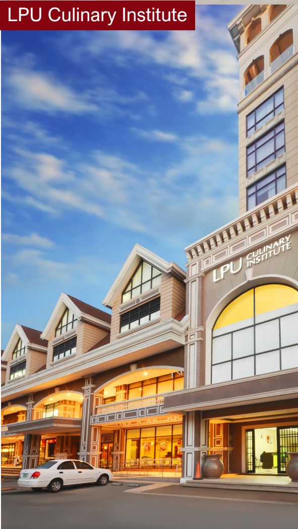
LPU Culinary Institute