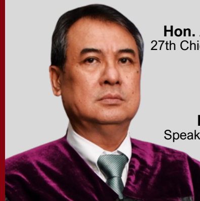
Hon. Alexander G. Gesmundo 27th Chief Justice of the Supreme Court of the Philippines